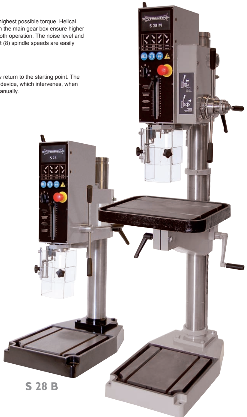
S 28 B

Square table 400 x 400 mm with side face plate, coolant complete with tubes, machine light halogen, tool package MT 3, chuck guard, micro switch for chuck guard, coordinate table 450 x 242 mm, coordinate table 584 x 242 mm (with or without automatic feed), flanged quill with double return spring for multi spindle drill head (with or without automatic feed), foot operated reversing switch, foot operated start switch, automatic reversing unit for tapping