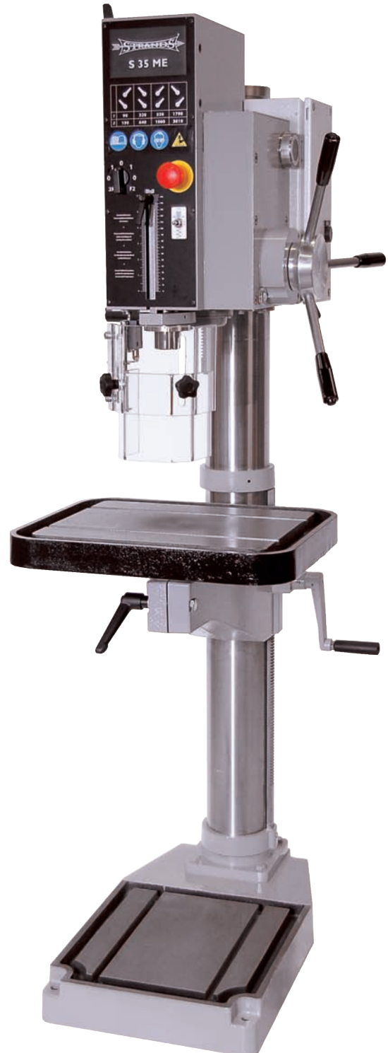
S 35 ME

Coolant complete with tubes, machine light halogen, chuck guard, micro switch for chuck guard, coordinate table 450 x 242 mm, coordinate table 584 x 242 mm (with or without automatic feed), threaded spindle nose with locking nut, automatic reversing unit for tapping, foot operated reversing switch, foot operated start switch, tool package MT 4