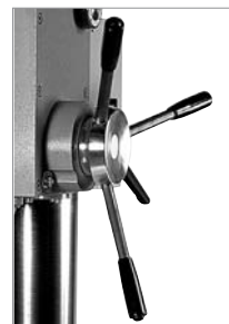
ME start/stop autom. feed right / left reverse